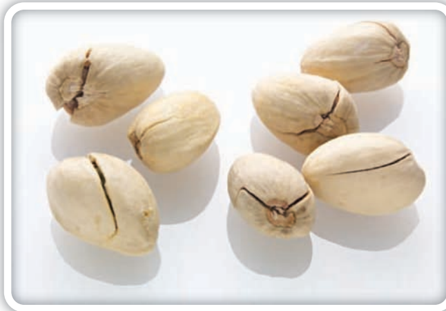
NO SPLIT ON SUTURE